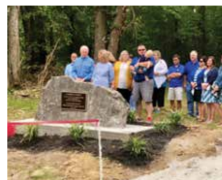
Dedication of 7th Street Clay City Red River Canoe-Kayak Access

The third annual Wild & Scenic Red Riverfest was held on September 7, 2019 to commemorate the Wild and Scenic Rivers Act and the Red