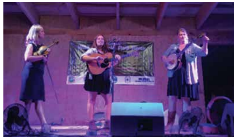
The Local Honeys performed at Meadowgreen Music Park

4.5 of the 8 mile section of Red Riverfest event paddle had not been cleaned before. Friends of Red River hosted 3 clean ups this year to deal with the horrendous garbage issues in order to prepare