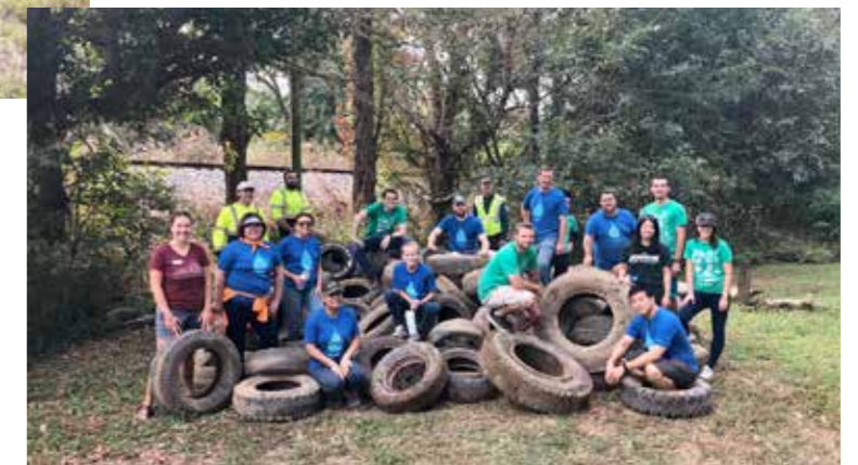
Kulmer Beach Cleanup on the Ohio River with Beam Suntory employees. September 26, 2019 in partnership with Louisville Metro Parks.

The sun has set on another successful creek cleanup season. In 2019, KWA hosted 15 different cleanup events by partnering with various watershed organizations, schools, corporate groups and churches. We are grateful for our network of volunteers and community partners who donate their time and energy to join us in getting down and dirty in order to help restore our beautiful natural resources for future generations.