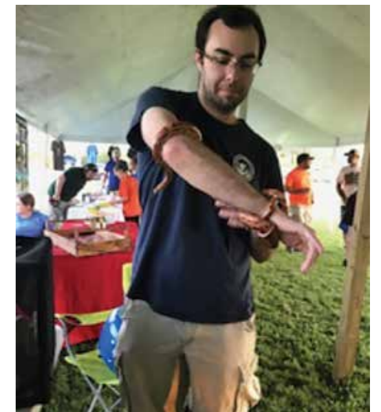
An ECU herpetologist gives visitors a closer view of indigenous wildlife.

Donors include: West Sixth Brewing, Ale-8, Southeast Mountain Guides, Red River Gorge Zipline Tours, Red River Rockhouse, Scenic Cabin Rentals, Daniel Boone Coffee Shop & Deli, Red River Gorgeous Cabin Rentals, Miguel's Pizza, Thrillville Adventure Park – Gorge Underground, Shut Up Larry, and Red River Gorge Hiking.