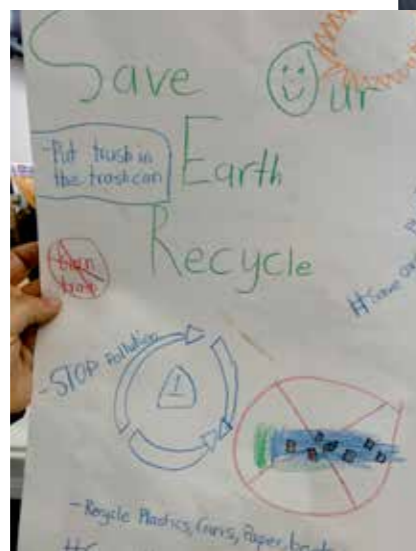
Wolfe County students learn about watershed sustainability.