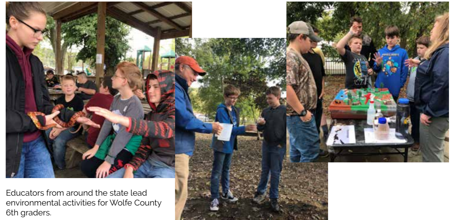
Educators from around the state lead environmental activities for Wolfe County 6th graders.