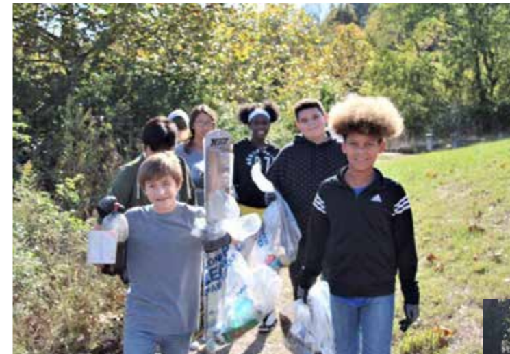
McNeely Lake Cleanup with Knight Middle School Students. October 17, 2019 in partnership with Louisville Metro Parks.

Through these cleanup efforts, we were able to remove 638 tires and approximately 27,000 pounds of trash including plastics, metal scraps, bottles and cans. If you can imagine it, we've found it. By cleaning 50 miles of waterways, we were able to help restore about 600 acres of wildlife and fish habitat across the state of Kentucky.