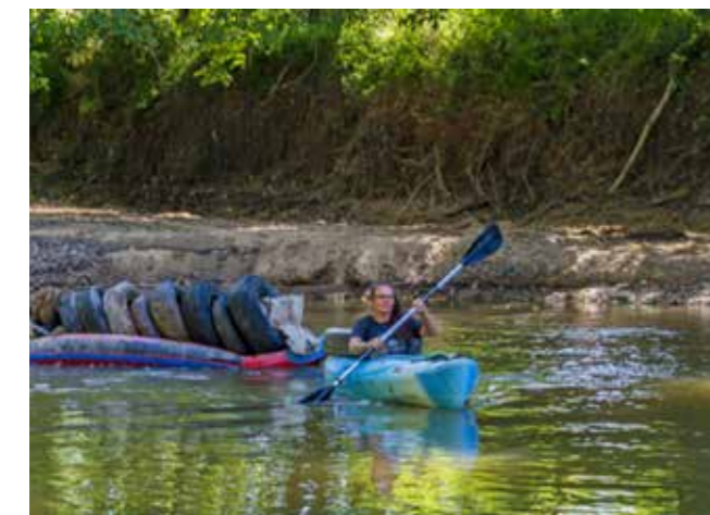
Clay City Loop Clean Up 2017