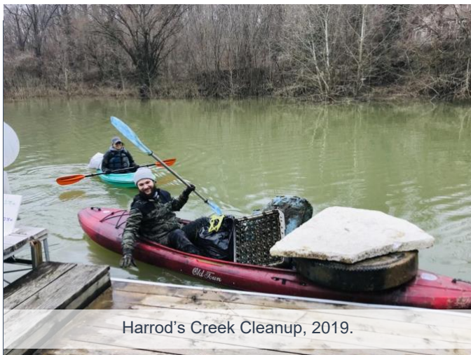
Harrod's Creek Cleanup, 2019.

Please provide us with details of your cleanup event here .