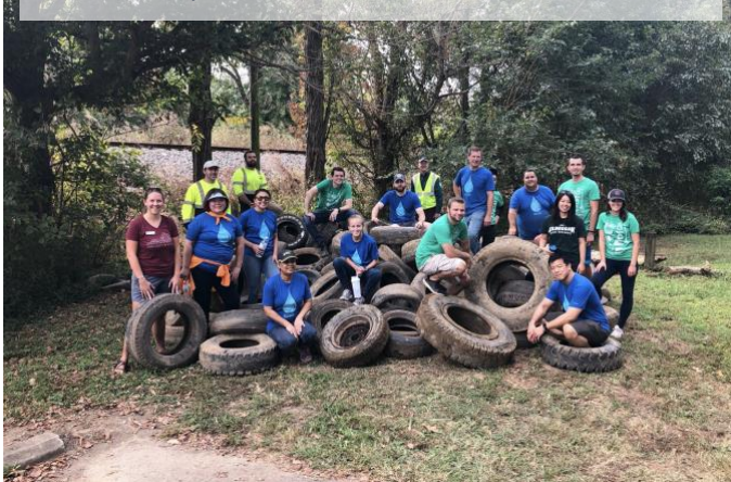
Beam Suntory volunteers at Kulmer Beach on the Ohio River.