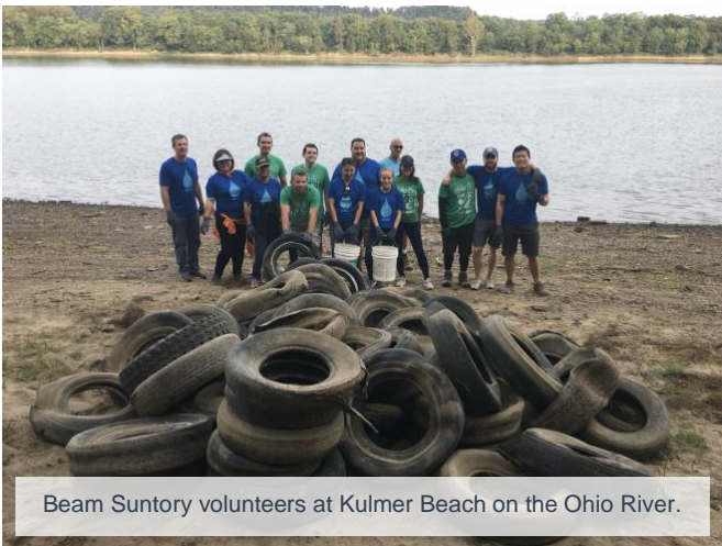
Beam Suntory volunteers at Kulmer Beach on the Ohio River.

In order to check river and stream flow levels in your area click here .