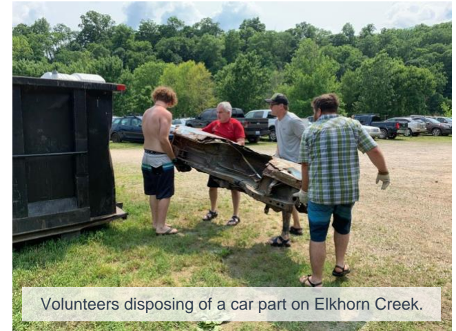
Volunteers disposing of a car part on Elkhorn Creek.

For more information about volunteering for cleanups or organizing your own cleanup please visit American Rivers Cleanup Page .