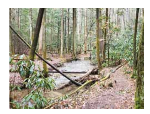
Copperas Creek in the Red River Gorge

Hiking upstream towards the falls, I expected to see just that: a stream. Yet, the creek revealed only its dry, rocky bed. This continued for nearly an hour, with no more than mere puddles between great slabs of sandstone and shale. "Where is the water?" I thought. Early springtime in Kentucky is particularly soggy and my expectations were being challenged. That was only true until I heard the familiar sloshing of a frantic creek. Surreal as it was, I stood upon the dry rocks before the flowing water as it sharply ducked into a manhole-sized opening beneath a massive fallen rock. The terminal point of this stream could not be seen because it was underground, yet no less pervasive than those above.