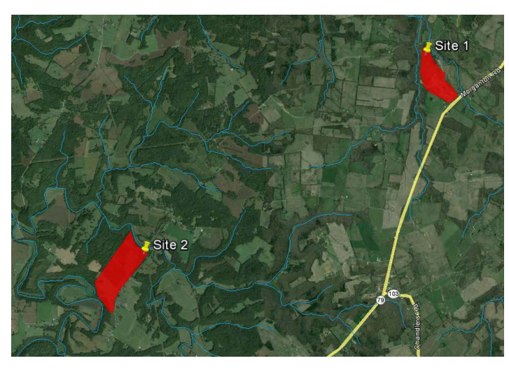
Site 1 of the tar sands project in Logan County is well underway, as you can see from the aerial imagery to the left. Site 2, which is larger and borders multiple waterways, is now open for public comment.