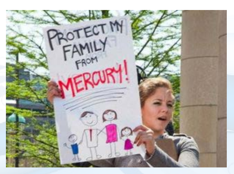
Mercury pollution is an immediate threat to public health and a persistent threat to future generations.

We will need you to help us make sure Kentucky officials, and ORSANCO knows "no more mixing zones for mercury". We'll have more on the issue in the next newsletter and will likely have e-action alerts and other notices as well. Be on the lookout this spring – and please take action. We can't emphasize enough the seriousness of this situation. Mercury persists in the environment for a long time so this problem is likely to get worse for years, maybe decades before it gets better.