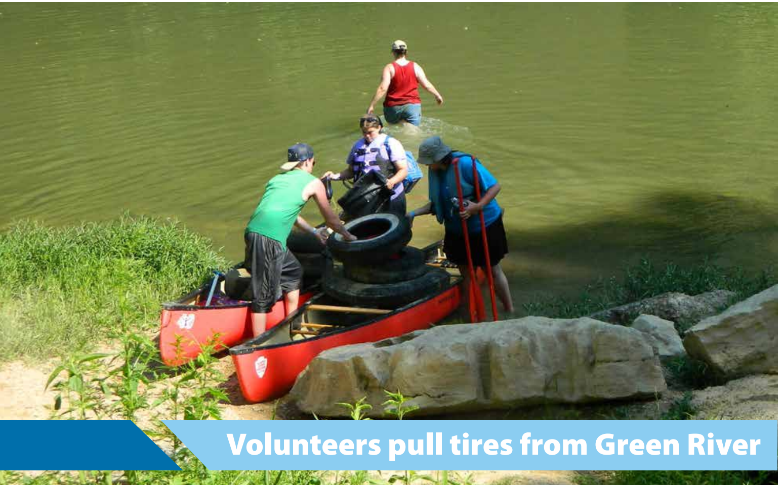
Volunteers pull tires from Green River

We work with community members to learn about and foster support for better stewardship of their local waterways. Our watershed program work has engaged thousands across many communities in learning about and gaining more appreciation for local streams, creeks, rivers, lakes, and wetlands. We work with communities to help implement projects that will improve water quality in places of need. In Bacon Creek, where we've worked for over 16 years, young fish have been seen for the first time in decades. In Eagle Creek, we supported the formation of a local watershed group that many years later helped improve creek conditions enough for it to be deemed healthy again!